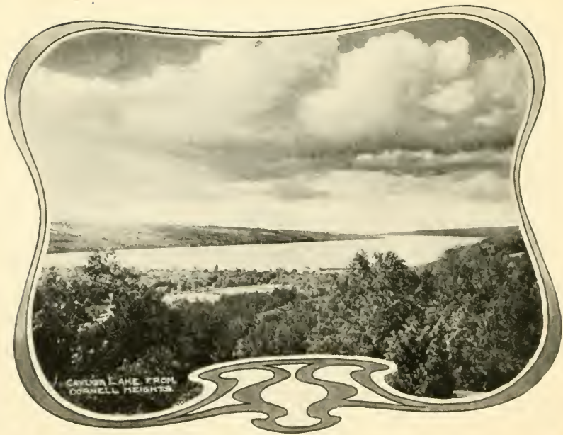
CAYUGA LAKE FROM CORNELL HEIGHTS